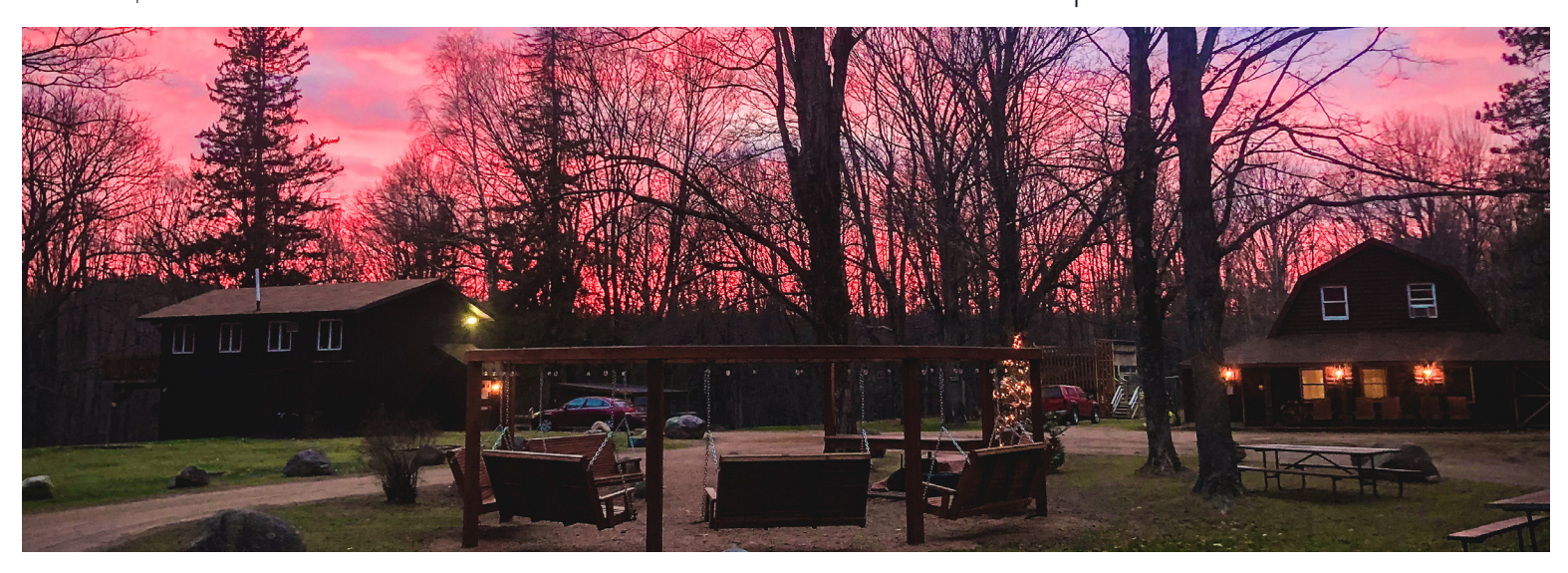
www.silverbirchranch.org | www.wolfriverrefuge.org | www.nicoletbibleinstitute.org | www.relate365.com

A huge thank you for the following specific Top Ten items given recently: compressor, hockey skates, cross-country skis, and basketball backboard.