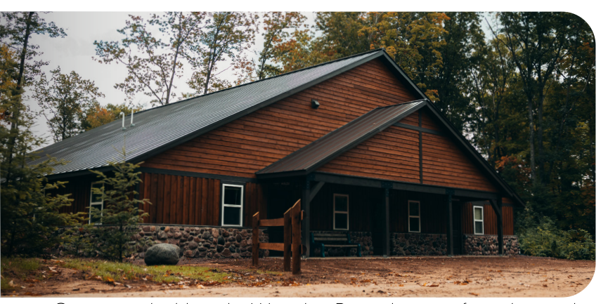
Our newest building, the Wranglers Roost, home to five cabins and one meeting room